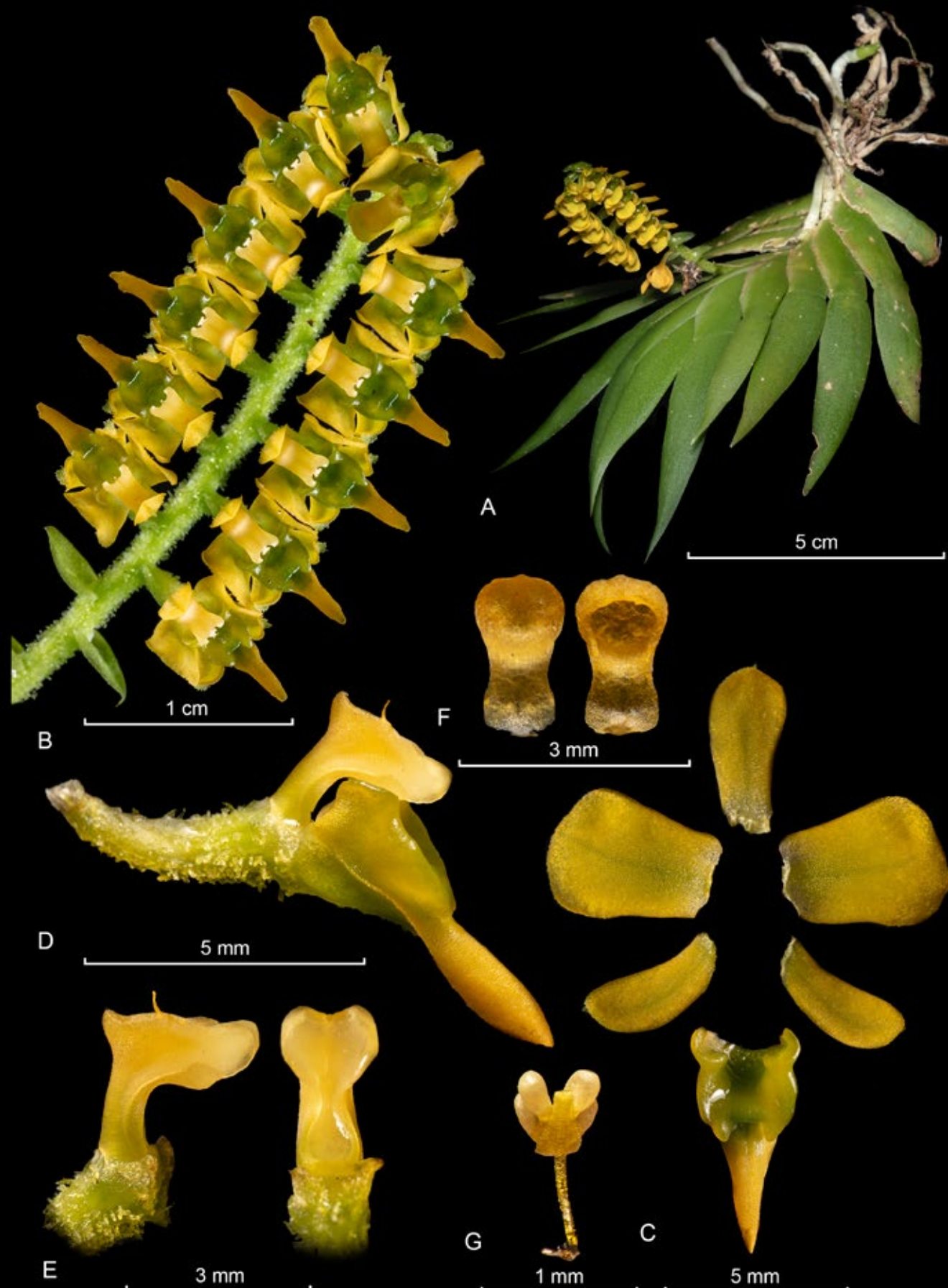
LCDP: Ornithocephalus escobarianus (Garay) Toscano & Dressler. A. Habit. B. Inflorescence. C. Dissected perianth. D. Column and lip. E. Column, side and ventral views. F. Anther cap, dorsal and ventral views. G. Pollinarium.